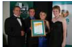
Pool Management Services received Service Excellence recognition 2008.

Nomination form are available from ROCCI's